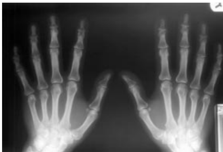
FIGURE 2. Top, this patient with hemochromatosis arthritis has symmetric arthropathy of second and third metacarpophalangeal joints with loss of cartilage and the formation of marginal beaked osteophytes (arrows). Bottom, in contrast, in this patient with osteoarthritis, mild osteoarthritis is visible in the distal interphalangeal joints of all fingers, especially the right second and third. There is minimal involvement of the right proximal interphalangeal joints.