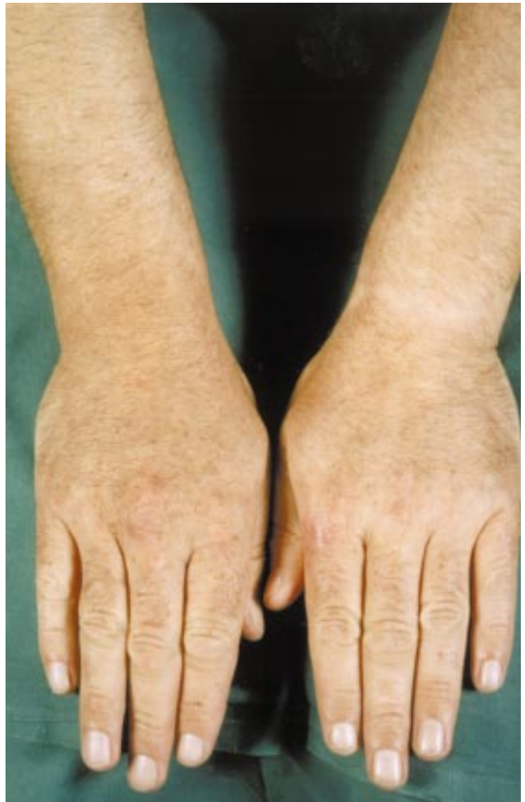
FIGURE 1. Skin pigmentation on the hands and forearms of a patient with hereditary hemochromatosis.