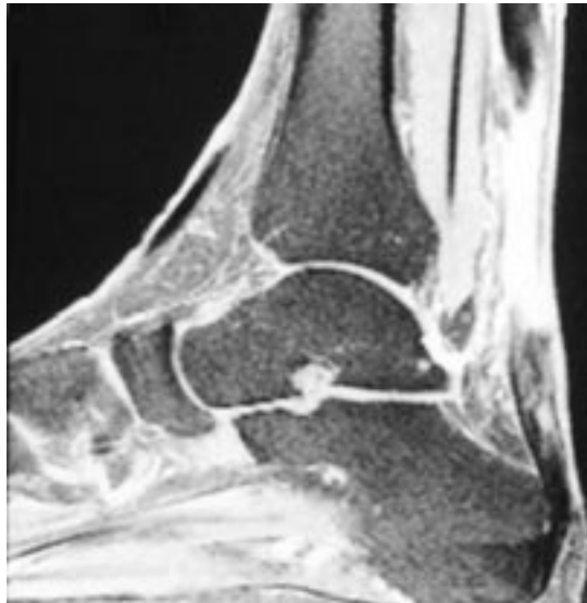
FIGURE 1. A 60-year-old man developed pain, swelling, and severe tenderness in both Achilles tendons while taking ciprofloxacin for recurrent urinary tract infections. The severity of symptoms and suspicion of a partial rupture prompted magnetic resonance imaging, which showed an intense, bright signal within the noninsertional region of the Achilles tendon, suggesting rupture. During subsequent surgical exploration, the central portion of the tendon was found to be necrotic and was resected. The patient's recovery was slow but complete.

Many case reports have suggested an association between fluoroquinolone use and