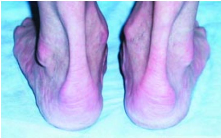
FIGURE 2. A 46-year-old woman had a 2-week history of right posterior calcaneal pain. A prominent bump was seen laterally in both heels, lifting the distal Achilles tendon. She was advised to wear sandals and then try better fitting shoes.