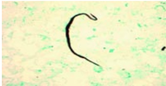
FIGURE 2. Strongyloides larvae in blood (Giemsa stain, oil immersion).

Upper gastrointestinal endoscopy is performed to evaluate her persistent nausea and