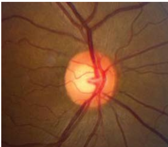
FIGURE 1. In retrobulbar optic neuritis, the inflammation and demyelination occur behind the globe of the eye. The optic disc appears normal with no signs of swelling or pallor.