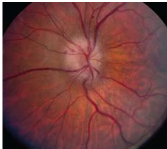
FIGURE 2. In papillitis, mild swelling and elevation of the optic disc can be seen. The small splinter hemorrhage seen at 10 o'clock is not typical of optic neuritis associated with multiple sclerosis.

Optic neuritis is important to recognize so that therapy can be started early