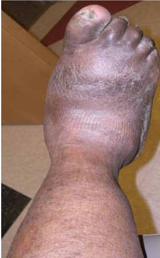
FIGURE 1. The patient's right foot at presentation.

He is 53 years old, with poorly controlled diabetes and peripheral neuropathy