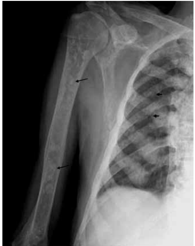
FIGURE 2. Radiologic evaluation showed diffuse osteosclerosis together with lytic and blastic areas (arrows).

A 72-YEAR-OLD MAN presented with abdominal cramping, diarrhea, intermittent flushing, asthenia, and a weight loss of 10 kg (22 lb) in the past 6 months. Physical