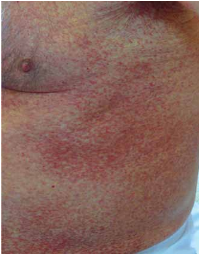
FIGURE 1. Confluent erythematous maculopapular lesions involving the trunk (maculopapular cutaneous mastocytosis).