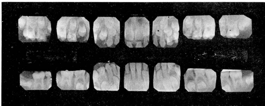
FIG. 3. Roentgenograms of teeth of child aged 7.

the second dentition, with the lower central incisors, were present and none of these were affected with dental caries. Roentgenograms (fig. 3) revealed badly carious deciduous molars, accompanied by dental sepsis. Well developed calcified posterior teeth were present, and there was no caries of the erupted six-year molars. In the upper incisors there was some sub-calcification of the dentine, as evidenced by indistinct pulp chambers. The enamel caps appeared thin and under-calcified. There was no clinical evidence of hypoplasia of the enamel of the teeth.