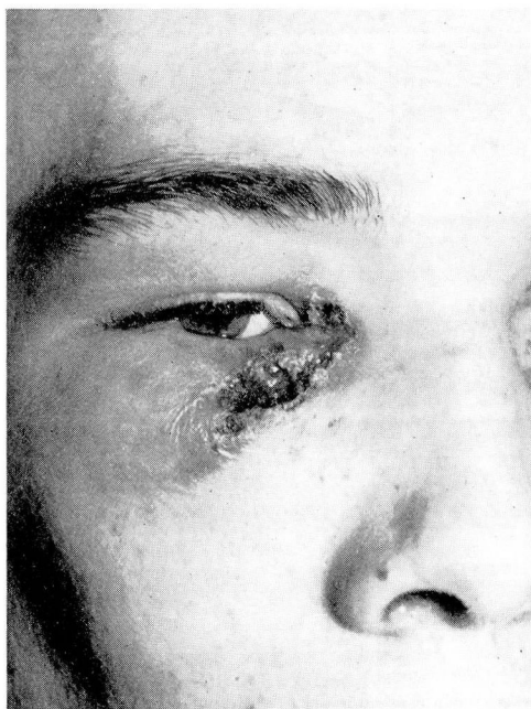
FIG. 2. Showing chronic ulceration of inner canthus and lower eyelid; ulcer of 6 weeks' duration.