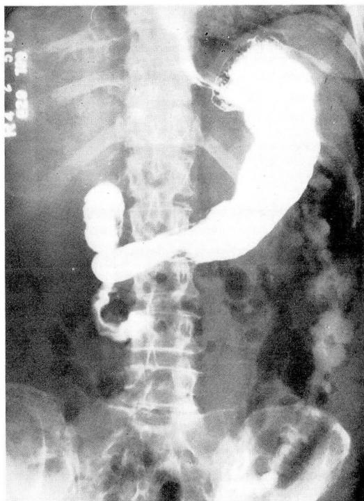
FIG. 2. Roentgenogram of stomach after bezoar had been removed. No signs of any filling defect.

lation of a 1 per cent hydrogen peroxide solution and mineral oil, and the subsequent aspiration of the stomach with the large Ewald tube for 4 hours daily on the succeeding 4 days, resulted in removal of the bezoar. The success of the procedure was established not only by the material obtained, but also by subsequent gastroscopic and roentgen examinations.