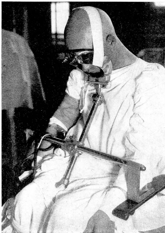
FIG. 1.—Patient in position for a suboccipital craniectomy or cervical laminectomy. The head rest is lined with sponge rubber and is adjusted to the contour of the patient's face.

The reduction of the intracranial venous pressure, of course, is the result of the improvement in venous return which occurs on elevation of the head. It is due partly to the pull of the column of blood from the brain to the right side of the heart and partly to a lowered intrathoracic pressure. To anyone who has observed