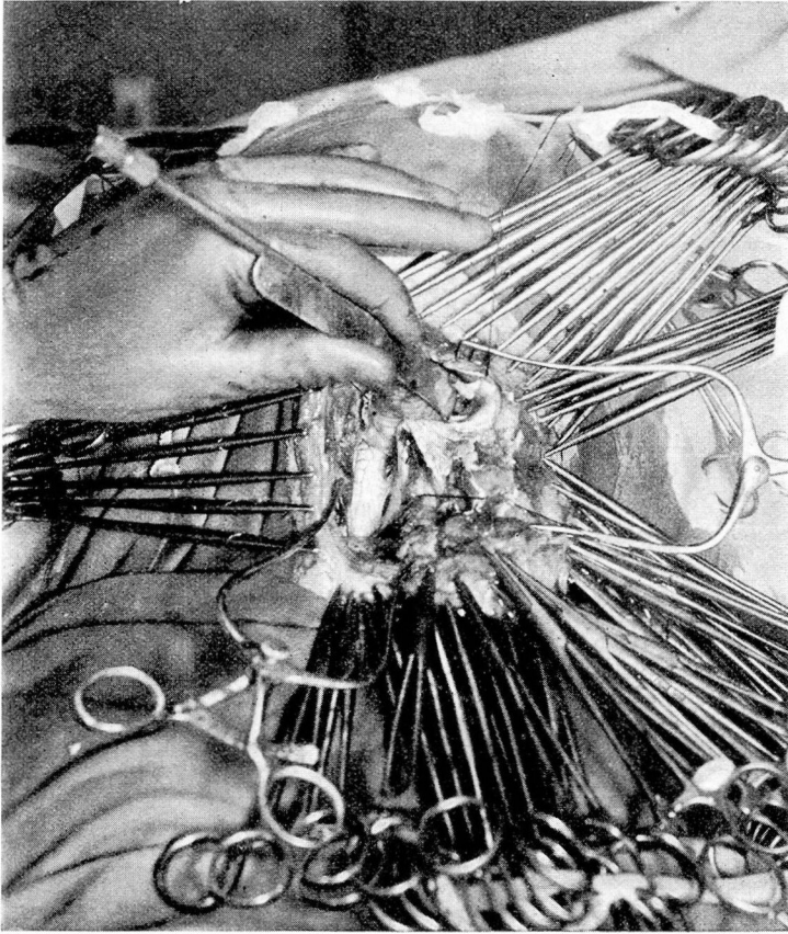
FIG. 2.—The exposure for resection of the fifth and ninth cranial nerves and second and third cervical posterior roots on the right side for relief of pain from carcinoma. Illustration shows the ease of exposure of the eighth nerve and angle. Combined hemisuboccipital craniectomy and hemilaminectomy.

operations with the patient in the erect, as compared with the horizontal position, the diminution of venous bleeding and the ease of its control in the former cannot help but be apparent. The reduction of the intracranial pressure is the most striking and significant advantage gained by elevation of the patient's head. This, of course, is secondary to the reduction of the intracranial