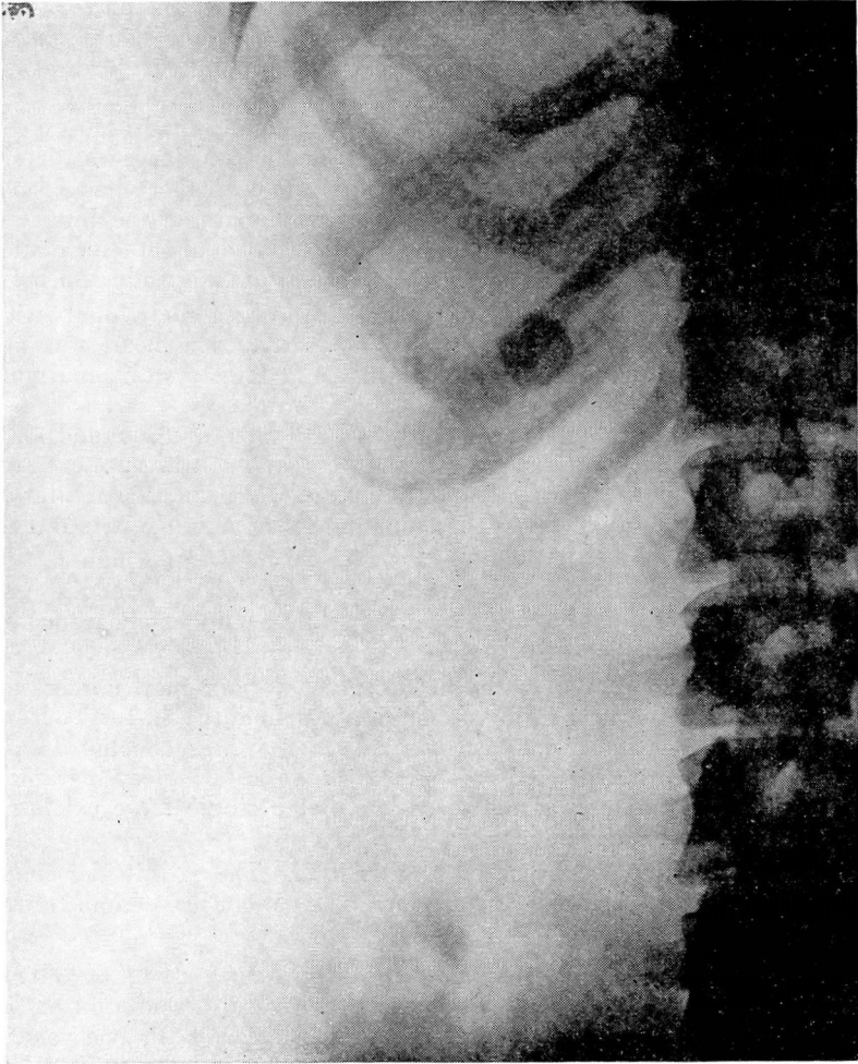
FIGURE 1, CASE 1.—Large gall stone in non-functioning gallbladder.

fifth intercostal space. The aortic second sound was moderately accentuated, and a short systolic murmur was heard over the apex and aortic area. The rate and rhythm were normal. There was moderate, diffuse thickening of the peripheral arteries, and the blood pressure was 160 mm. systolic and 84 mm. diastolic. The percussion note was dull over the base of the left lung up almost to the angle of the scapula, and the breath sounds and voice transmission were suppressed over this area. A moderate number of medium moist râles were heard over the base of both lungs. Abdominal examination was negative. There was no peripheral edema.