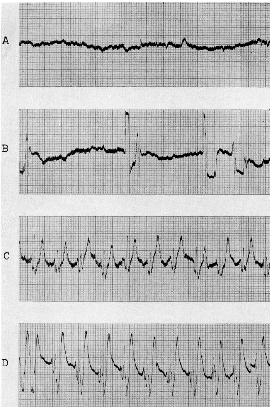
Fig. 2. Re-establishment of normal sinus rhythm in the dog shown in Figure 1 by removal of the aortic clamp, allowing perfusion of the coronary arteries with blood from the pump oxygenator. The time required was longer than usual because of an unusually traumatic intracardiac procedure in this instance.

A. Aortic clamp removed 24 minutes after cardiac arrest had been induced.