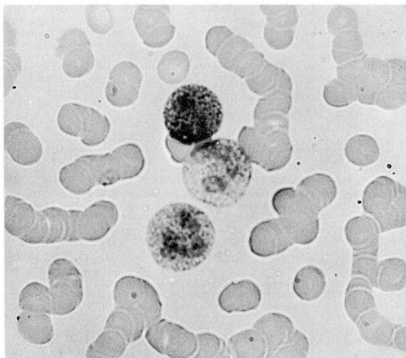
Fig. 1. A photomicrograph of three segmented neutrophils showing alkaline phosphatase activity represented by a (red-brown) precipitate of varying density in the cytoplasm. The upper neutrophil is graded 4+, the central neutrophil, 2+, and the lower neutrophil, 3+. Magnification \times 1000 .

When alkaline phosphatase is present in a cell ( Fig. 1 ) it is represented by a red-brown precipitate in the cytoplasm. The amount of this precipitate varies