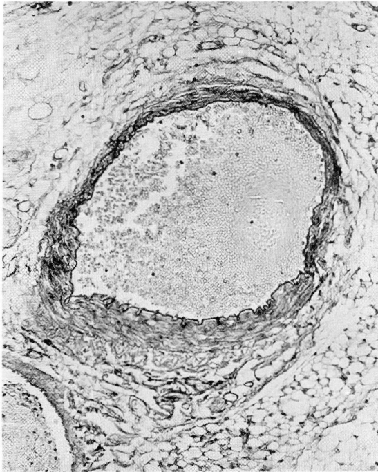
Fig. 3. Renal artery from a rat treated as described in Figure 2 , showing extensive distention of half of the vessel, stretching of the internal lamina, thinning of the wall, and smudging of the muscularis. Periodic acid-Schiff stain; magnification X 145.

chyma. These lesions consisted of focal stretching of the arterial wall, flattening of the internal elastic membrane, and medial necrosis. In the heart and pancreas also there were a few vascular lesions; furthermore, edema and small hemorrhages were in the pancreas.