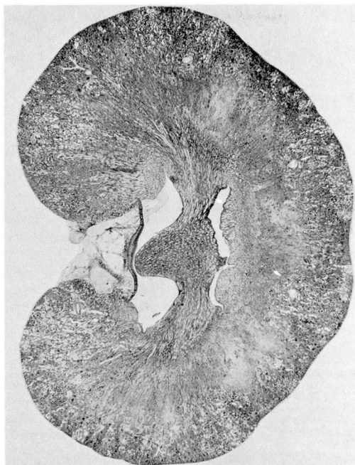
Fig. 4. Kidney from a rat that received 1 dose of 3 mg. of metaraminol and was left without treatment during 10 days, showing a distorted outline due to areas of necrosis and scarring. Note the widespread tubular dilatation. Periodic acid-Schiff stain, magnification X 5.

2. Effects of hydralazine in metaraminol-treated rats. Hydralazine prevents renal cortical necrosis caused by large doses of serotonin, 2,3 as well as occlusive glomerular lesions resulting from injection of renin into desoxycorticosterone-treated rats. 4 This protective and apparently nonspecific effect of hydralazine led us to the following investigations.