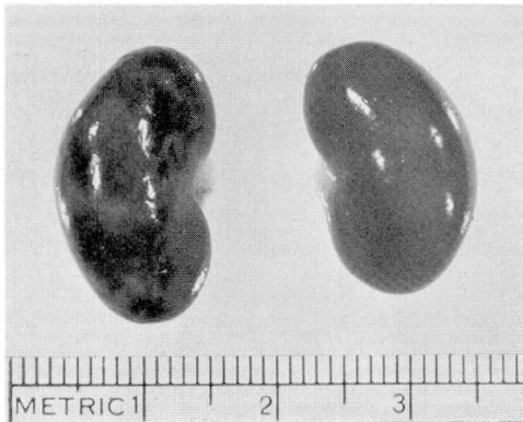
Fig. 1. On the left, kidney from a rat that received 2 mg. of metaraminol, showing zones of ischemia and congestion. On the right, kidney from a rat that received 2 mg. of metaraminol plus 0.5 mg. of hydralazine, showing absence of lesions.

1. Effects of metaraminol in normal (control) rats. In acute experiments, Sprague-Dawley rats that weighed from 250 to 300 gm. were each attached on a board while under sodium amytal anesthesia (dosage: 9 mg. per 100 gm. of body weight). Metaraminol was injected subcutaneously in a single dose of 1 or 2 mg. and the kidneys were examined through an incision in the abdominal wall. After ten minutes, the fur became ruffled and wet, the eyes protruded, and frothy fluid appeared around the mouth and nose. The kidneys were mottled by alternate areas of congestion and ischemia ( Fig. 1 ).