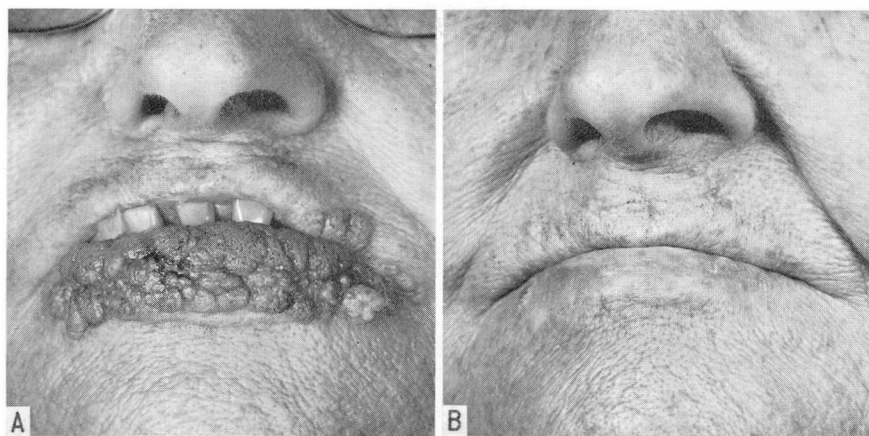
Fig. 2. Case 2. Verruca acuminata of lip before hot-water bath treatment. Photo was taken August, 1960; appearance was unchanged in January, 1961. B, Appearance of lip in March, 1961, after about eight weeks of hot-water applications.

would surface temperatures penetrate; that is, would the entire depth of epidermis be involved?