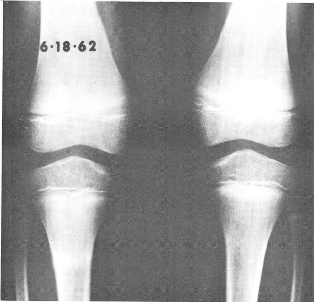
Fig. 3. Case 2. Roentgenogram taken on June 18, 1962, showing stress fracture of the right tibia.

The laboratory tests were all within normal limits. Roentgenograms of the legs revealed evidence of a stress fracture of the right upper tibia ( Fig. 3 ).