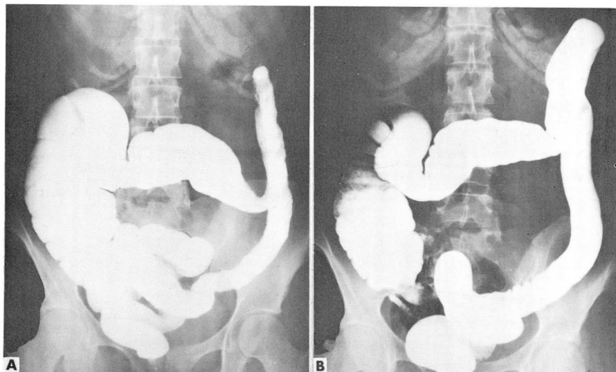
Fig. 1. A, Roentgenogram showing evidence of active ulcerative colitis. Note the finely serrated margin of the rectosigmoid through the splenic flexure. B, Two years later; there is no evidence of ulcerative activity.

Three of the acutely ill patients responded satisfactorily. They all improved within a month of the initiation of the alkylation therapy. One of these was a young woman with a rectovaginal fistula ( Fig. 1A ) that was no longer evident after three months. Two years later, findings on barium enema and proctosigmoidoscopic examinations were entirely normal ( Fig. 1B ).