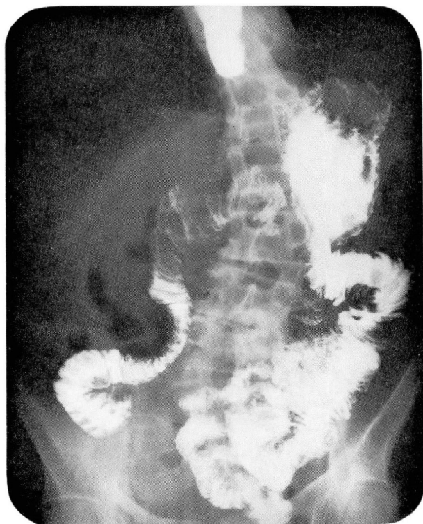
Fig. 1. A roentgenogram from a normal gastrointestinal series obtained in November 1966. This study was made after repeated episodes of vomiting, which were attributed to bile gastritis and psychogenic reaction.

A roentgenogram of the chest, a plain roentgenogram of the abdomen, and an upper gastrointestinal series of roentgenograms showed normal function, as did the intravenous and the retrograde pyelograms. No further episodes of vomiting occurred during the two weeks of observation in the hospital. Upon discharge from the hospital he was advised to follow a diet for dumping syndrome and to take vitamins. He was reexamined periodically, and by November 1, 1966, had experienced five episodes of persistent vomiting. At no time was he observed during one of these "spells." Bile gastritis and psychogenic reactions were considered to be contributory to the symptoms. An upper gastrointestinal roentgenogram in November 1966 revealed a normal gastrojejunostomy. The gastric remnant, stoma, and both loops appeared unremarkable ( Fig. 1 ).