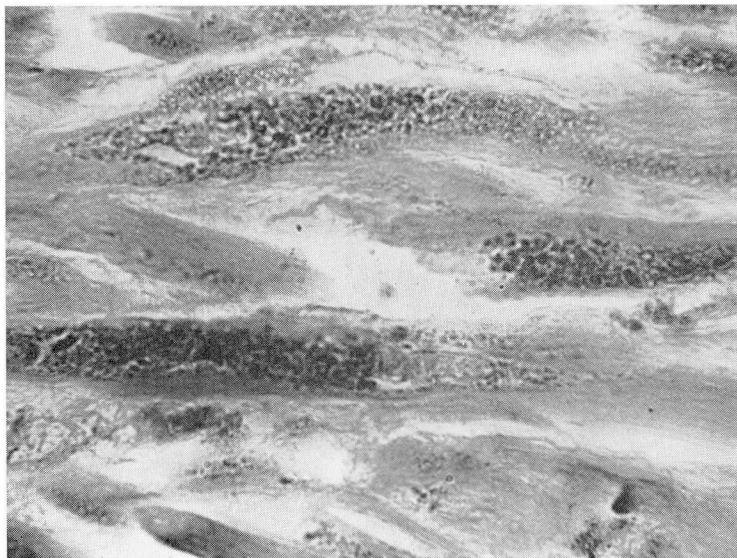
Fig. 4. Photomicrograph of a section of the muscularis propria shown in Figure 3 . Hematoxylin-eosin-methylene blue stain; magnification \times 900 .

tion and a defect in lipid formation leading to an accumulation of various lipid products. Some support to this view is obtained from the electron microscopic studies of affected smooth muscle (from a patient other than the one's whose case we report). The intracellular cytoplasmic granules, from 1000 Å to from 1 to 2 \mu in cross diameter, distorted small Golgi complexes, mitochondria, and bundles of myofilaments. The granules were osmiophilic, varied in size, and some possessed a single-unit limiting membrane ( Fig. 4 ).*