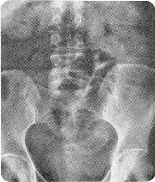
Fig. 3. Case 3. Plain abdominal roentgenogram shows the prominent loop of small bowel, which at operation was found to be incarcerated within a spigelian hernial sac.

The results of the physical examination were normal except for the presence in the left lower abdominal quadrant of a fluctuant, tender mass that was 10 cm long. The patient's temperature was 98.6 F, the pulse rate 88, and the blood pressure 110/80 mm Hg. The blood hemoglobin content was 14 g per 100 ml, the hematocrit 40, and the leukocyte count 19,100 per cubic millimeter. The serum electrolyte, blood urea nitrogen, and serum creatinine values were normal. A chest roentgenogram was normal. Roentgenograms of the abdomen showed a distended loop of small intestine in the left lower part of the abdomen ( Fig. 3 ). After preoperative preparation with nasogastric suction, and intravenous adminis-