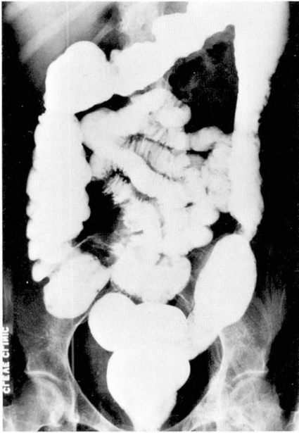
Fig. 2. Roentgenogram of the colon after barium enema, July 1968. Residual ulceration in descending colon but improvement from previous study. Note lack of shortening of colon.

fistulous tract could not be identified. A small bowel series showed normal jejunum and proximal ileum, with some abnormality of the distal ileum.