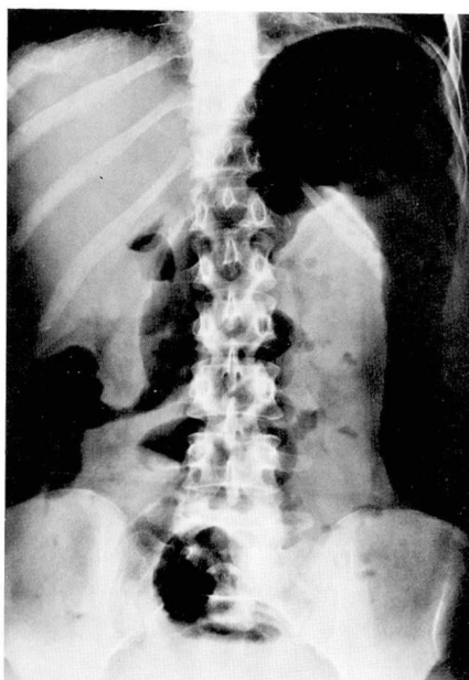
Fig. 3. Roentgenogram of abdomen, August 1971. Toxic megacolon, with dilatation of colon maximal in splenic flexure.

On physical examination temperature was 102F; pulse, 116/min; and blood pressure, 120/64 mm Hg. The patient appeared "toxic" with dry skin and mucous membranes, hypoactive bowel sounds and rebound abdominal tenderness. There was brawny pitting edema of legs. The anal canal was thickened and edematous. A plain film of the abdomen showed dilatation of the transverse and descending colon, and paralytic ileus of the small bowel ( Fig. 3 ). Hemoglobin was 12.6 g/100