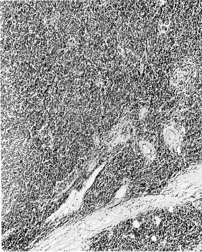
Fig. 1. Histology of a supraclavicular lymph node. Normal architecture of the lymph node is replaced by a uniform population of lymphocytes which infiltrate through the capsule into the surrounding adipose tissue. Hematoxylin and eosin, \times 80 .

IgG and reacted with antisera specific for IgG and Fc* fragment, but did not react to \kappa , \lambda , Fab \kappa or Fab \lambda † antisera (Fig. 3). Immuno-electrophoretic comparison with whole human serum indicated an \alpha -globulin mobility. A repeat lymphocyte transformation to PHA was 39%. The urine continued to contain a heavy chain fragment.