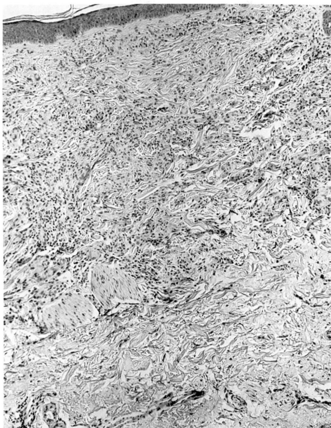
Fig. 3. Granuloma annulare showing diffuse necrobiosis in the lower dermis and a palisading histiocytic inflammatory reaction (hematoxylin and eosin, original magnification \times 64 ).