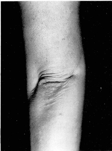
Fig. 2. Nodular lesions of granuloma annulare over the elbow.

100,000 units per day. By May 1972 alkaline phosphatase was 15 King-Armstrong units and serum calcium and phosphorus values remained normal.