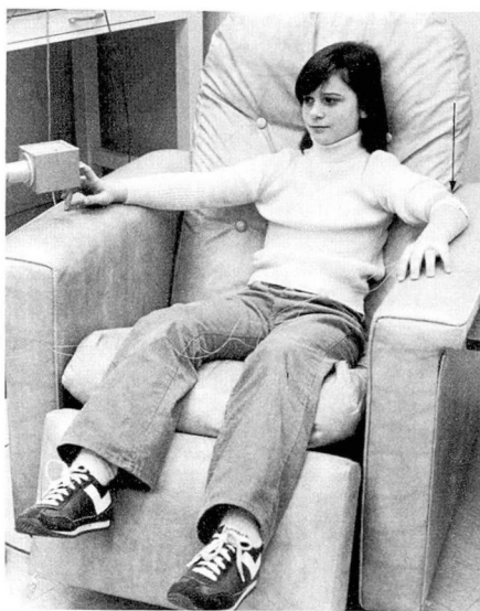
Fig. 1. Healthy 11-year-old child undergoing quantitative cutaneous sensory testing. The young subject is seated comfortably in a large laboratory chair. Electrodes are in place about the left forearm (arrow), and the response lever is being manipulated by the contralateral hand.

Children were studied in a pleasant laboratory situation. When they were comfortably seated in a large chair, the nature of the testing apparatus and their participation in the test was explained to them. With younger children, this was always carried on in the presence of a parent. The situation was comfortable and amusing for the child. Stimuli were not painful. Once cooperation and comfort were ensured, a response lever was placed in easy reach. The cutaneous areas to be studied were cleansed and coated with conductive jelly. Stimulating electrodes were applied closely to the skin area to be tested and held in place with nonocclusive elastic straps ( Fig. 1 ). The stimulating electrodes consisted of 9-