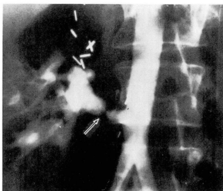
Fig. 1. Preoperative right transfemoral aortogram. Stenosis (arrow) and poststenotic dilatation are present with the aortorenal saphenous vein graft.

The results of physical examination were normal with the exception of a holosystolic abdominal bruit. The blood urea nitrogen (BUN) and serum creatinine values were normal. A transfemoral abdominal aortogram was obtained. The left renal artery was normal, and circulation to the upper pole of the right kidney was supplied by a small polar vessel. Severe focal stenosis and poststenotic dilatation were present within the aortorenal saphenous vein graft ( Fig. 1 ). Both hypogastric arteries were normal. Before renal vein renin studies could be obtained, the patient experienced pain in the right flank associated with microscopic hematuria. Results of a cystoscopic examination were normal and, although an intravenous pyelogram demonstrated normal excretory function in the right kidney suggestive that the vein graft had not occluded, an