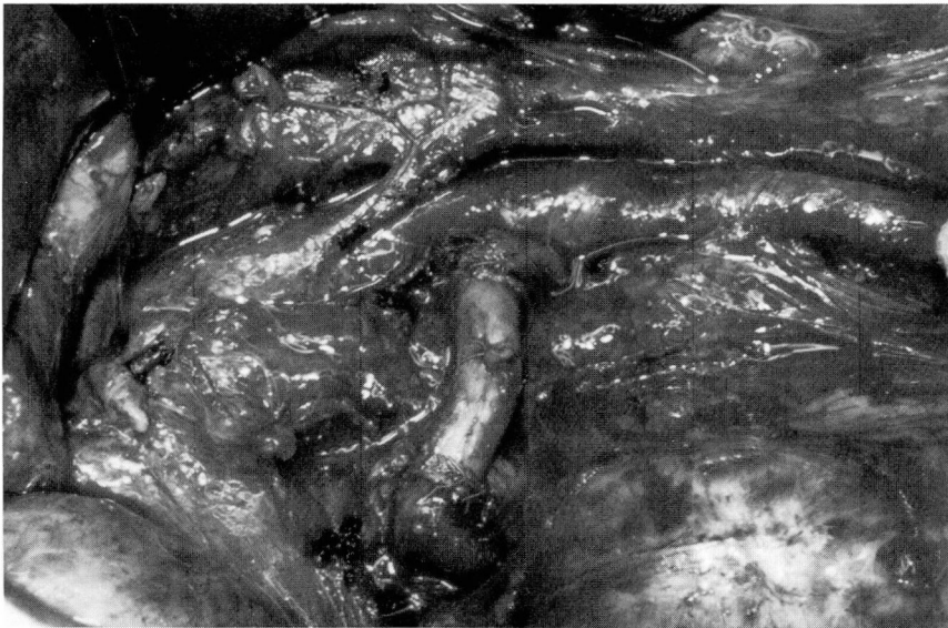
Fig. 3. Operative photograph. The completed reconstruction, with the autologous hypogastric artery used to replace the previous aortorenal saphenous vein graft.

mm Hg without medication during the 18 months since the reoperation.