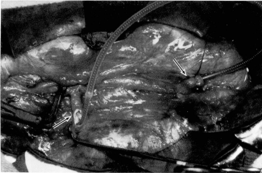
Fig. 2. Operative photograph. The aortorenal vein graft has been opened at the site of anastomosis (left arrow). A silastic carotid endarterectomy shunt has been inserted between the proximal stump of the right hypogastric artery (right arrow) and the distal renal artery.