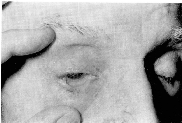
Fig. 1. Cicatricial pemphigoid changes in the left eye.

The Department of Dermatology was then consulted and histopathologic studies were done. A biopsy specimen of buccal mucosa submitted at that time for routine hematoxylin-eosin staining as paraffin sections was devoid of stratified squamous epithelium and showed only angioplasia and chronic inflammation in the remaining submucosal connective tissue when examined by light microscopy. A diagnosis of cicatricial pemphigoid was made on the basis of the history and classical physical findings.