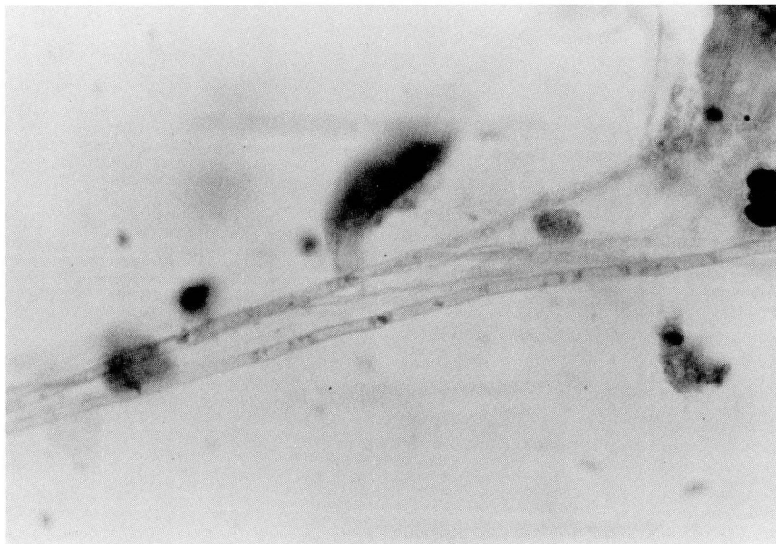
Fig. 1. Septate hyphae in vitreous smear (Gomori methenamine silver, \times 1,000 ).

replacement with a porcine bioprosthetic valve and placement of a prosthetic graft in the ascending aorta. Persistent postoperative bleeding required reexploration and repair of a leak at the distal aortic graft-aorta anastomotic site. A total of 31 U of various blood products was transfused. The patient's postoperative course was complicated by bilateral diaphragmatic paralysis necessitating intermittent ventilator support and a tracheostomy.