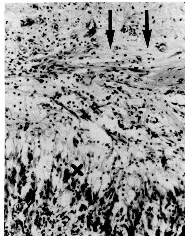
Fig. 3. A. Right-globe postlensectomy-vitrectomy, displaying area of focal retinitis with dense vitreous adhesion (arrows) (hematoxylin-eosin).

B. Degenerative changes in the retina (X) with adherent vitreal fibrovascular proliferation (arrows) (hematoxylin-eosin, \times 10 ).