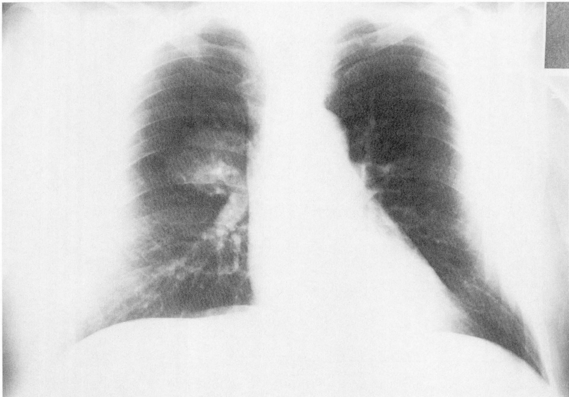
Fig. 1. Chest radiograph showing a mass in the right hilar region.