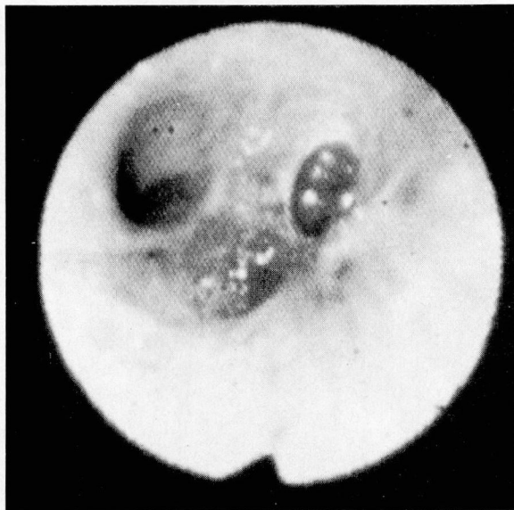
Fig. 2. Bronchoscopic image showing lesion in the right upper lobe bronchus.

abdomen and pelvis was normal with the exception of a solitary gallstone. A bone scan showed increased uptake consistent with a degenerative joint disease. No other abnormalities were identified.