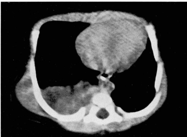
FIGURE 2. CT scan shows a mass in the right posterior hemithorax.

Intraspinal extension was not evident. No displacement or fistulous involvement of the esophagus was seen on an esophogram.