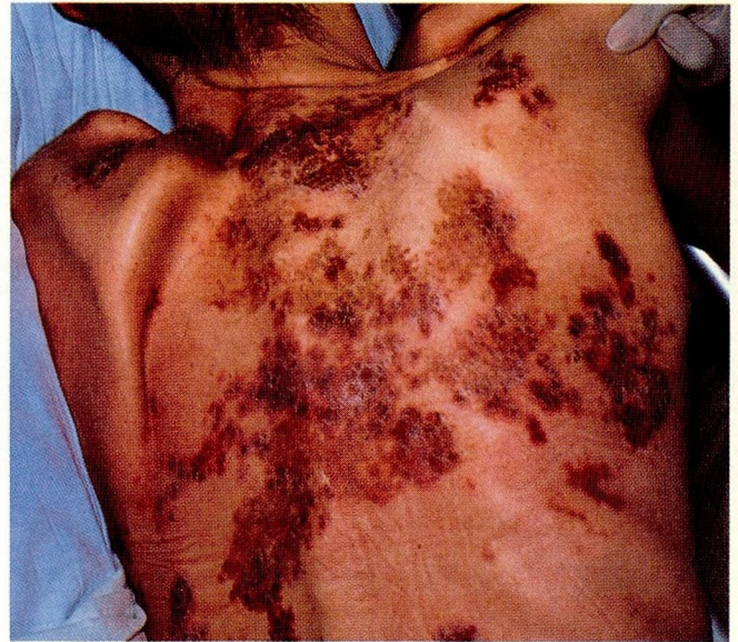
FIGURE 3. Chronic, thick, scaling plaques on the back of an AIDS patient.

This case of recalcitrant, generalized, cutaneous polydermatophyte and Candida infections in an AIDS patient responded poorly to topical, oral, and intravenous therapy. Development of resistant strains of fungus may have played a role. The patient died of respiratory arrest secondary to a five-lobe pneumonia with cytomegalovirus, gram-positive cocci, and invasive in-