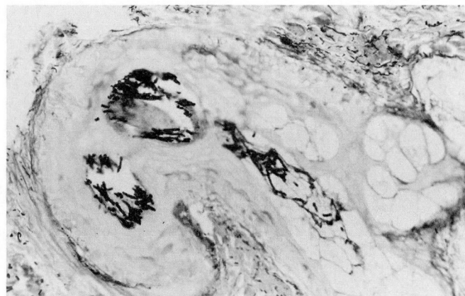
FIGURE 2. Hair follicle with abundant hyphae as demonstrated with Gomori-methenamine-silver stain. Original magnification 400 \times .

revealed several scaling, minimally erythematous plaques on the forearms, back, chest, feet, and arms. There were broken hairs on his chest, legs, and scalp. A patchy alopecia was noted over the entire scalp. The left ear was noted to have diffuse erythema and some crusting. The perianal skin exhibited superficial erosions with surrounding erythema. Several erythematous scaling plaques were noted on the buttocks and groin.