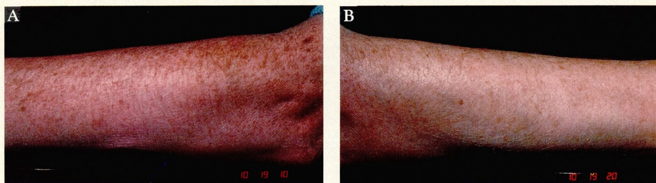
FIGURE 2. Placebo-treated left forearm (A) and tretinoin-treated right forearm (B) after 9 months of therapy with tretinoin emollient cream 0.01%. Note the difference in mottled hyperpigmentation and fine wrinkling.

showed improvement in overall severity by week 22. The earliest improvements were noted in roughness (median 12 weeks) and mottled hyperpigmentation (median 16 weeks).