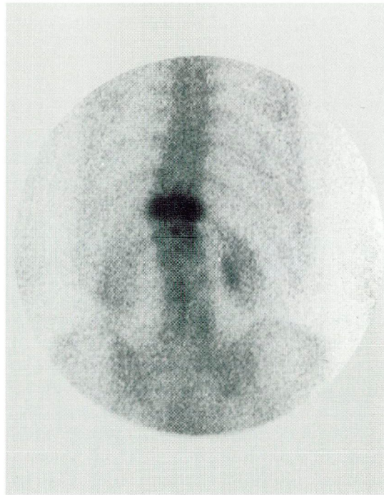
FIGURE 2. Radiograph (left) shows a vertical compression fracture (arrow) in an elderly patient. Bone scan (right) shows increased uptake in the acutely compressed vertebra.

(NSAIDs), which they often take to relieve back pain.