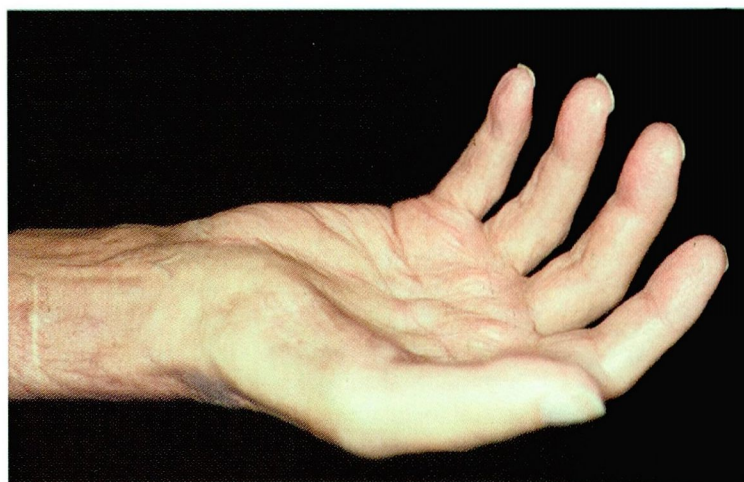
FIGURE 1. Top, bilateral shoulder pads in a patient with beta 2 -microglobulin amyloidosis who was receiving long-term hemodialysis. Bottom, fixed flexion contractures of the fingers due to beta 2 -microglobulin amyloid deposits in the hand of a patient receiving long-term hemodialysis. Amyloid deposits, appearing as soft tissue fullness around the wrist, resulted in carpal tunnel syndrome and atrophy of the thenar muscle.