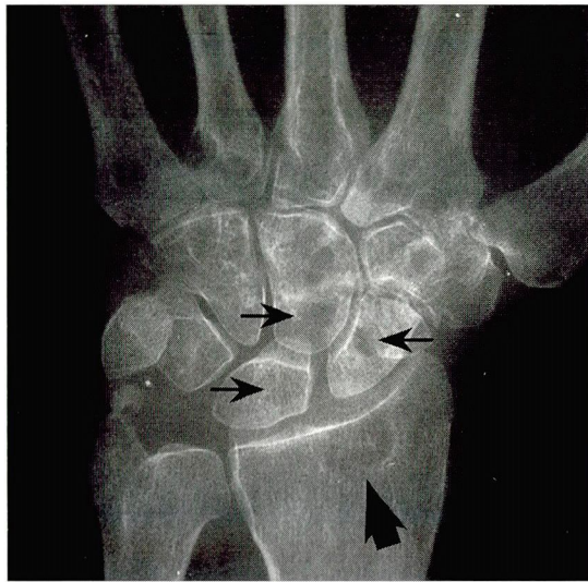
FIGURE 2. Wrist radiograph of a patient with beta 2 -microglobulin amyloidosis who was on long-term hemodialysis, showing cysts in the carpal bones (small arrows) and the distal radius (large arrow.)

humans, normal serum levels range from 1.5 mg/L to 3 mg/L. Beta 2 -microglobulin is excreted by the kidney, so serum levels in patients with chronic renal failure can increase by 10-fold to 20-fold. However, elevated levels of beta 2 -microglobulin alone do not explain the development of amyloidosis.