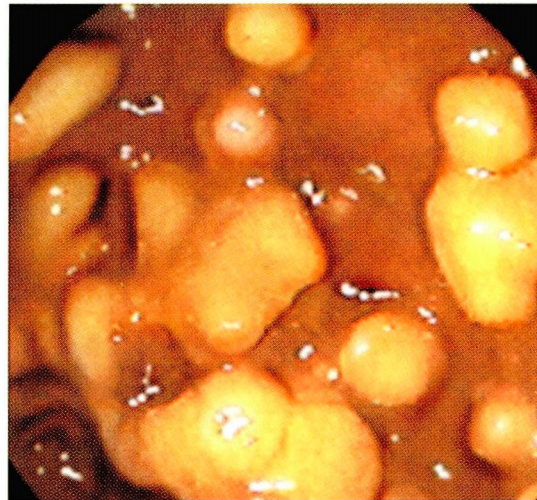
FIGURE 1. Colonoscopic view of pseudomembranous colitis secondary to Clostridium difficile .

The enzyme immunoassay is more common and practical for clinical use. It has a sensitivity of 70% to 95% and a specificity of 99% to 100%. 1 Sending more than one stool sample for enzyme immunoassay testing during the