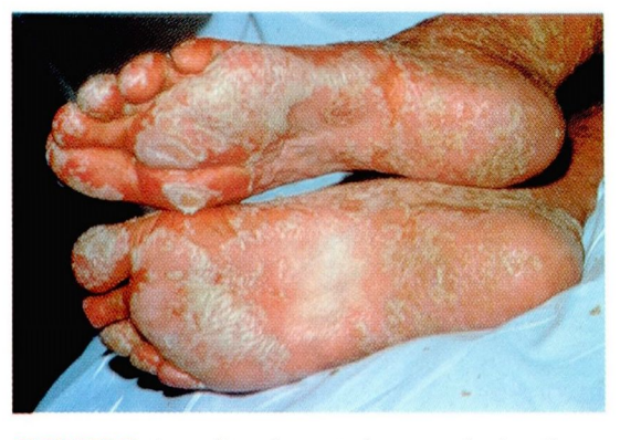
FIGURE 3. Localized pustular psoriasis of the soles.

ma accounts for only 1% to 2% of all cases of psoriasis, making it the least common form.