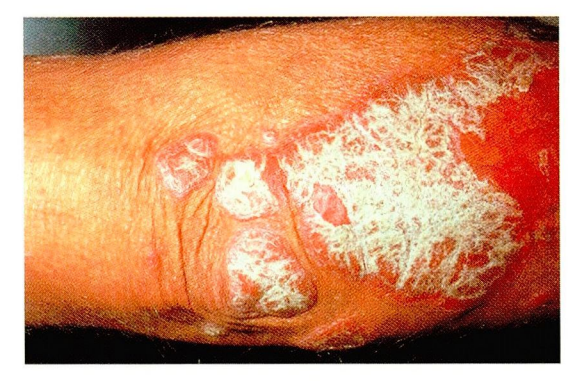
FIGURE 1. The classic fully developed skin lesion of psoriasis vulgaris.

rubra pilaris, drug reactions, and cutaneous T-cell lymphoma.