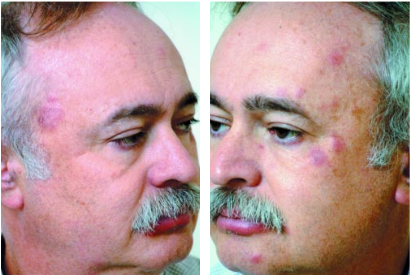
FIGURE 1. The clinical appearance of the multiple facial plaques.

Q: A 52-YEAR-OLD MAN presented to the dermatology clinic with a nonpruritic rash that developed over the past 24 hours. He had no ongoing medical problems and denied taking any medication. He reported having a similar facial eruption 7 months earlier, which had resolved in 2 weeks without treatment. On further questioning, he remembered having taken Aleve (brand of naproxen sodium),