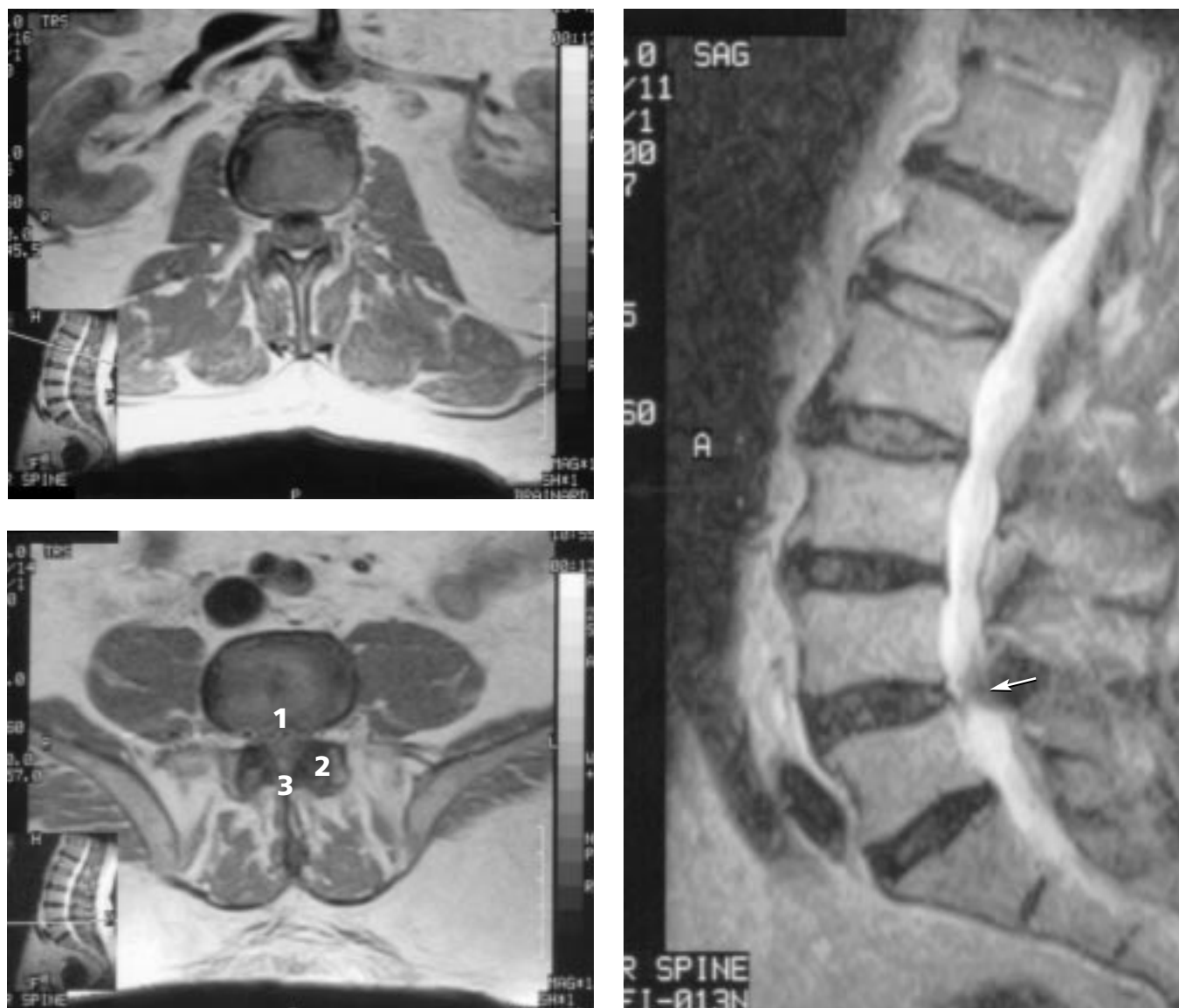
FIGURE 1. Magnetic resonance imaging (MRI) scans in a 75-year-old man. Top left , minimal degenerative changes at the L1-L2 level. Bottom left , severe lumbar canal stenosis at the L4-L5 level due to (1) disc degeneration, (2) facet hypertrophy, and (3) ligamentum flavum hypertrophy. Right , lateral view. Note the stenosis at L4-L5 (arrow).

mobility, with or without spinal canal stenosis. Extension is usually more limited than flexion. 10,11