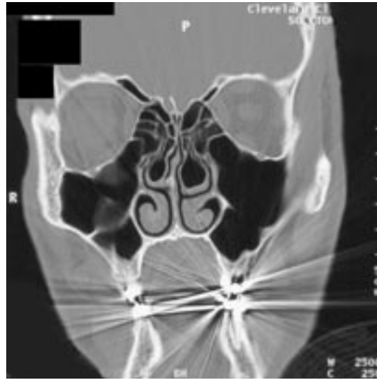
FIGURE 1: Coronal computed tomographic (CT) scan of the paranasal sinuses provides detailed information and an unparalleled view of the sinuses, including the bony anatomy.

ADAPTED FROM LANZA DC, KENNEDY DW. ADULT RHINOSINUSITIS DEFINED. OTOLARYNGOL HEAD NECK SURG 1997; 1179(SUPPL):S1-S7.