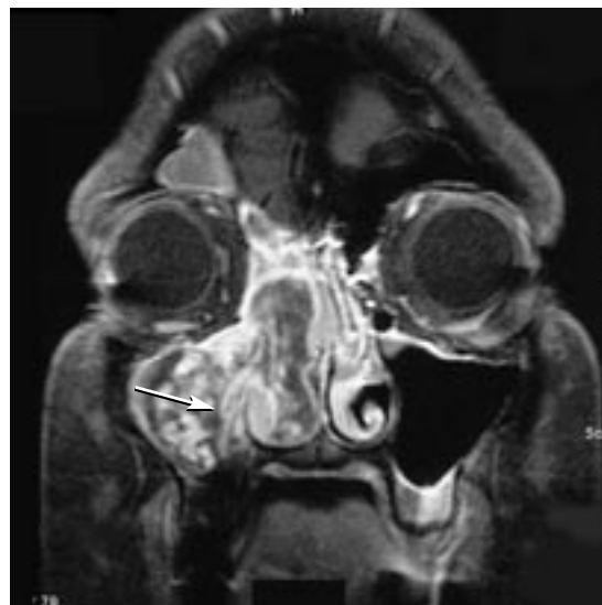
FIGURE 3: Coronal magnetic resonance imaging with gadolinium contrast shows extensive inverted papilloma of the right nasal cavity and paranasal sinuses (arrow).

In refractory or atypical cases requiring confirmation of sinusitis, simple axial or coronal CT can be sufficient for screening purposes. Patients with chronic or recurrent acute rhinosinusitis refractory to medical therapy or acute rhinosinusitis with complications require more detailed CT imaging to further