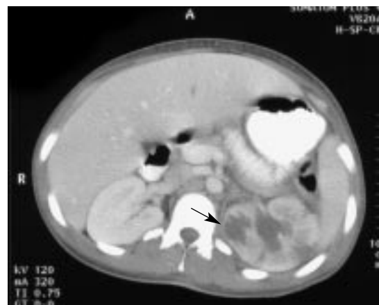
FIGURE 1. Computed tomographic scan showing left pyelonephritis and an intrarenal abscess (arrows).

use of a diaphragm clearly increase the risk of urinary tract infection.