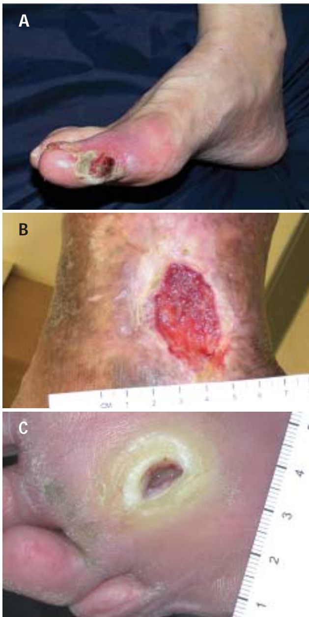
FIGURE 2. An ischemic ulcer in a patient with peripheral arterial disease that has progressed to critical limb ischemia (A), in contrast with a venous stasis ulcer (B) and a neurotrophic ulcer in a patient with diabetes (C).

text of risk factors for atherosclerosis to improve diagnostic accuracy. They noted that a PAD screening score derived from pulse readings using a handheld Doppler probe was particularly helpful for determining which patients should undergo further studies. 16