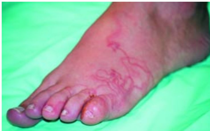
FIGURE 2. Individual larval tracts on the dorsal surface.

A 22-YEAR-OLD WHITE WOMAN presents with redness, rash, and pain in her left foot for the previous 5 days. She says she has not had a fever or chills. She cannot recollect any injury or falls. Before coming to this office, she had gone to an urgent care center, where she received a prescription for cephalexin, which she has taken for the past 2 days, with no improvement.