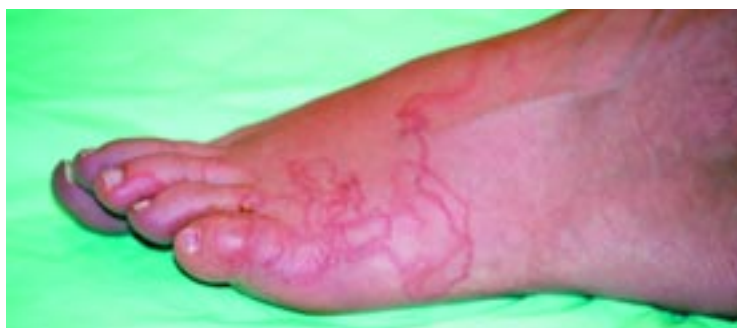
FIGURE 1. Note the serpiginous vesicular erythematous rash on the lateral surface of our patient's left foot.