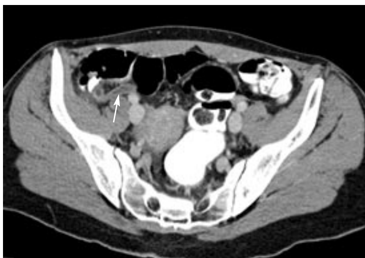
FIGURE 3. Classic image of acute appendicitis (arrow) on CT in our patient.

exceed 6 mm in diameter. The appendix is mobile, having its own mesentery, and its position relative to the cecum can vary.