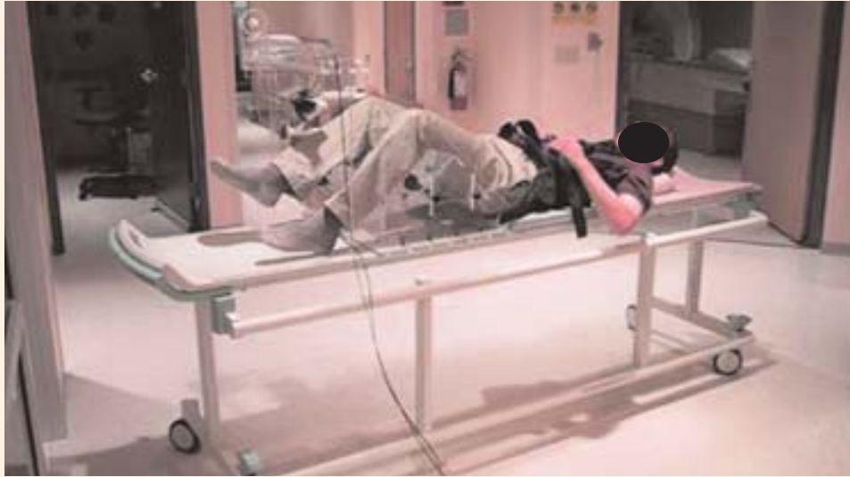
FIGURE 2. Brain activation before and after treadmill training is sampled in a stroke survivor using functional magnetic resonance imaging during unilateral knee movements. A plexiglass scaffold has been custom-designed to define range of motion and minimize concomitant head motion.

ters of ambulation. Whether the cortical areas influence ambulatory recovery mediated by exercise training or whether the recruitment of spinal gait areas is needed to improve motor control after stroke is not known in humans. We will test the hypothesis that the recruitment of cortical and/or subcortical areas is relevant to some or all of the exercise-induced neuroplasticity response to treadmill rehabilitation. If a consistent pattern of brain regional activation is associated with an improvement in walking ability, this finding will suggest potential brain targets for neurally directed rehabilitation interventions. If brain targets for rehabilitation produce viable therapeutic improvement in walking and cardiocirculatory performance (such as \text{VO}_2 ), this will be further evidence of heart-brain interactions.