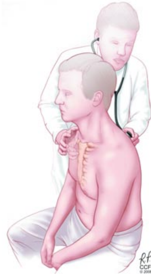
FIGURE 4. Auscultatory percussion: the examiner taps on the patient's manubrium while listening with a stethoscope to the patient's back.