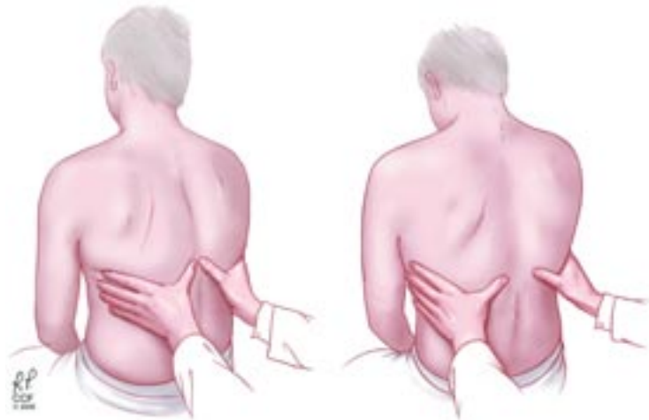
FIGURE 1. Palpation to detect asymmetry of chest expansion, a sign of pleural effusion.

TABLE 3 shows some of the common physical findings, depending on the amount of pleural fluid present.