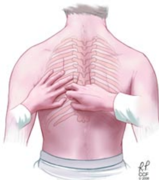
FIGURE 3. Chest percussion—the examiner taps the patient’s chest on alternating sides to detect the characteristic dullness of pleural effusion.

The auscultatory percussion technique was first described by Laennec and used to delineate the size of several organs by placing the stethoscope directly above the structure to be outlined, followed by percussion from the periphery towards the organ of interest. The original technique was subsequently modified for the examination of the chest by Guarino. 27