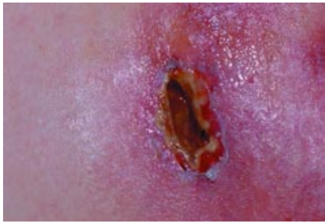
FIGURE 1. A necrotic, weeping ulcer from the upper extremity, measuring approximately 2 cm.