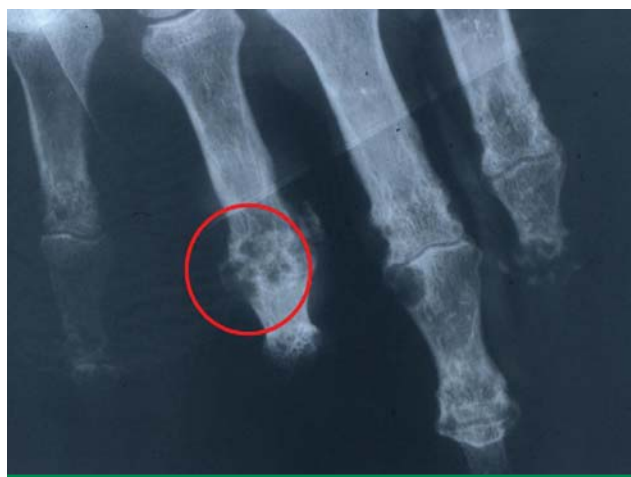
FIGURE 3. Large, cystic joint erosions producing an overhanging edge (circled area) characteristic of chronic gouty arthritis.

key point is that low-grade inflammation persists and crystals remain in the joint, which can lead to progressive disease. 14