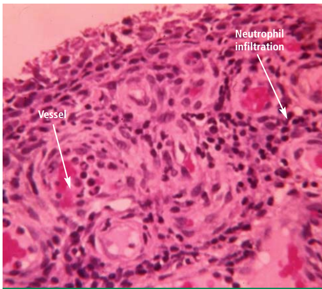
FIGURE 1. Synovial tissue of a patient with acute gout. Note the dilated vessels, representing the throbbing, hot, erythematous joint, and the large numbers of neutrophils.

sites of trauma or irritation. The first metatarsophalangeal joint is often affected, at least in part because it is a site of mechanical stress. Likewise, mechanical irritation from leaning on the elbow may cause crystals to deposit in the olecranon bursa.