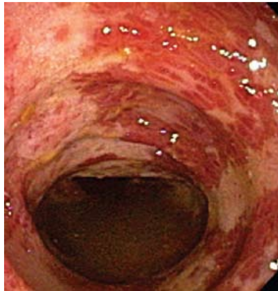
FIGURE 3. Severely active ischemic colitis with extensive ulceration and submucosal hemorrhage distributed segmentally in the distal transverse colon and descending colon.

Drugs should always be considered as possible culprits