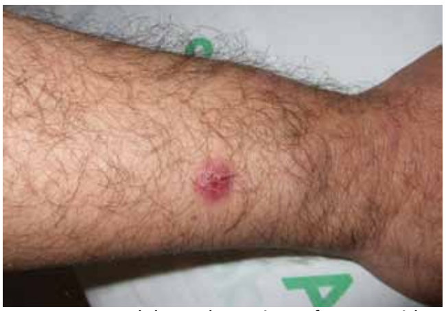
FIGURE 2. A nodule on the patient's forearm with a sporotrichoid distribution. Locoregional lymph nodes were not palpable.

Laboratory testing (hemography, biochemistry panel, coagulation test, and C-reactive protein) are normal. Routine bacterial cultures of blood and wound drainage are repeatedly negative. Histologic study (FIGURE 3) reveals signs of acute and chronic inflammation (a mixed infiltrate with lymphocytes, neutrophils, and histiocytes) with abundant bacilli by Ziehl-Neelsen and Giemsa stains.