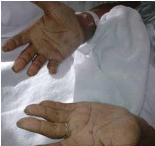
FIGURE 1. The patient has hyperpigmentation of the skin creases on the palms, as well as on the lips and the lower gum.

A 65-YEAR-OLD MAN PRESENTS with a 2-month history of generalized weakness, dizziness, and blurred vision. His symptoms began gradually and have been progressing over the last few weeks, so that they now affect his ability to perform normal daily activities.