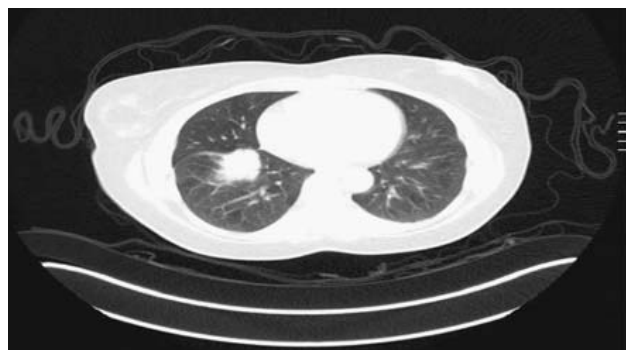
FIGURE 1. Fused 18 F-fluorodeoxyglucose-positron emission tomography is used for staging patients with non-small cell lung cancer. This image shows an N2-node.

Stress testing, whether by nuclear imaging or dobutamine echocardiogram, is also indicated, especially if considering pneumonectomy. A quantitative ventilation-perfusion scan is indicated for a more definitive evaluation of pulmonary function.